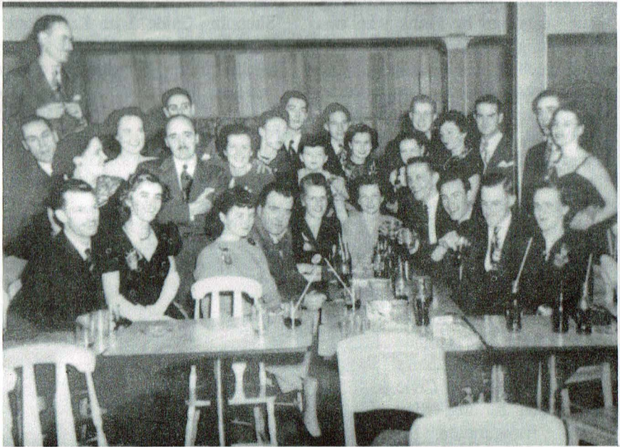
CHEX Christmas party, Club Aragon December 1943

The plan is to make this a regular feature at the Centre. If you have an interest in these old recordings then contact the Fairview Heritage Centre to be put on a contact list for the next demonstration.