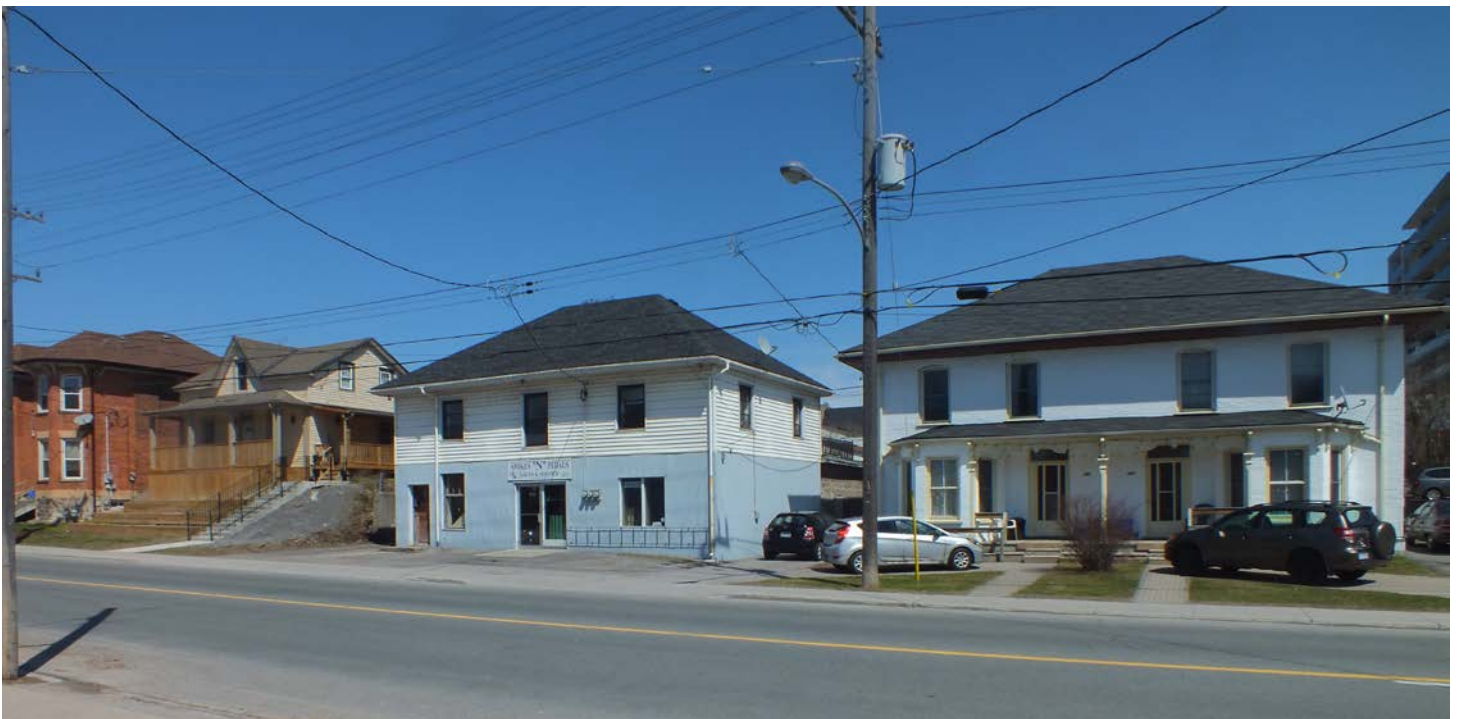
Aylmer Street near Brock Street