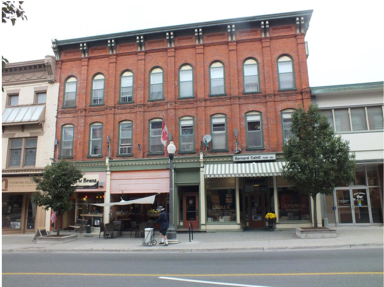
Cox Commercial Building, Hunter Street